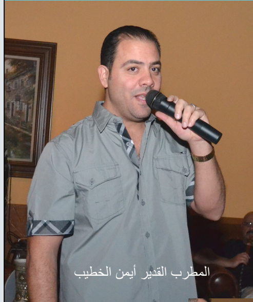
المطرب القدير أيمن الخطيب

اسهر على كيفك : واستمع الى الطرب وشارك في الغناء والرقص على كيفك : ونفخ عليها تنجلي بأطيب أركيلة أيضاً وأيضاً على كيفك : هذه هي أجواء كيف كافيه ومجلة لبيانون تايمز تقدم لجميل دعبول بمناسبة عيد ميلاده سنوات عديدة وألف مبروك . وهذه بعض اللقطات نتمنى أن تكون على كيف كيفك .