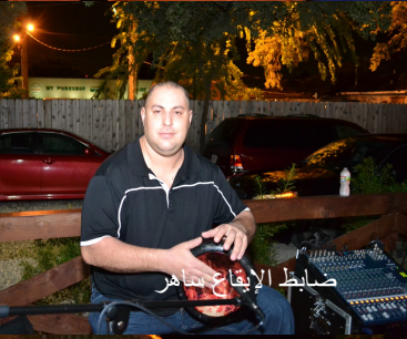
ضابط الإيقاع ساهر