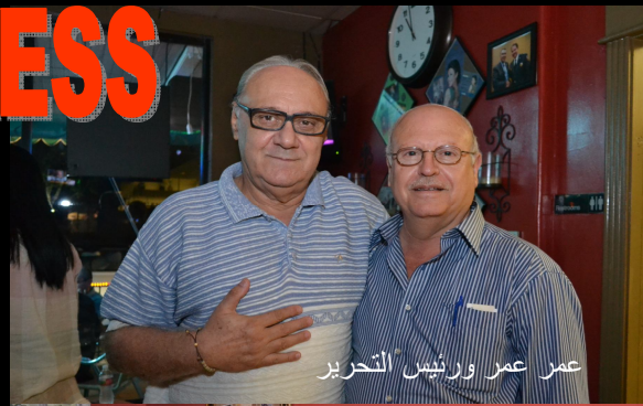
عمر ورئيس التحرير