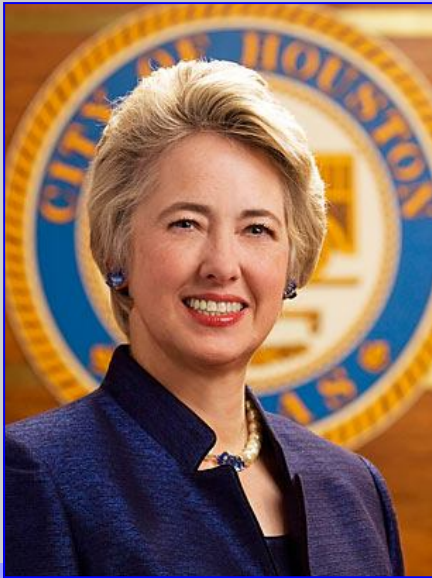
By Mayor Annise D. Parker