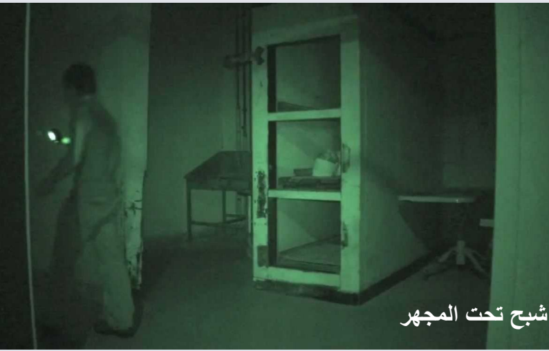
شبح تحت المجهر