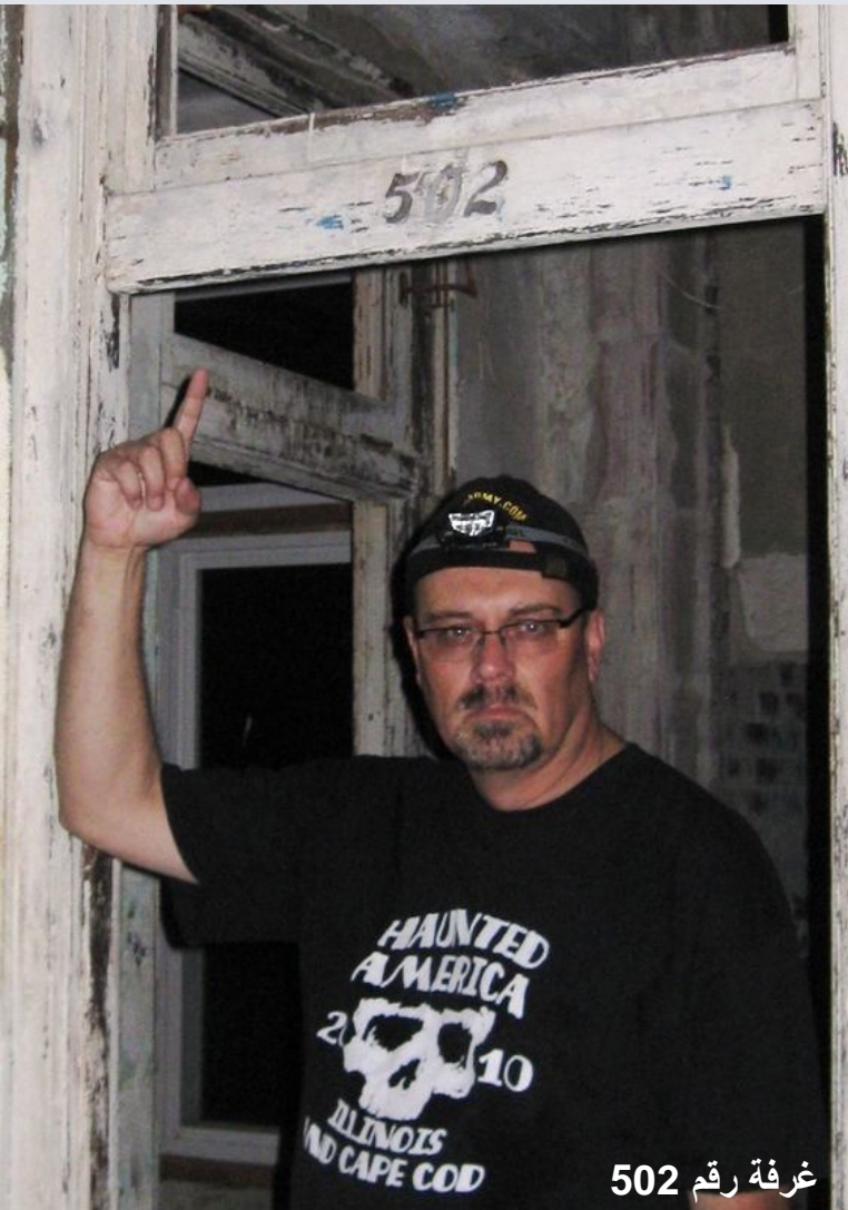
غرفة رقم 502

في الحقيقة لا يوجد أبداً ما يثبت حقيقة القصص التي تدور عن المبنى ،على العموم يبقى خيار تصديق أو تكذيب هذه القصة متروكاً إليك عزيزي القارئ ... ومن يدري ربما تكون هناك أشباح حقيقية داخل وفيرلي هيلز وربما كل تلك الروايات من نسيج زوار المبنى من يدري؟؟ العلم عند الله.