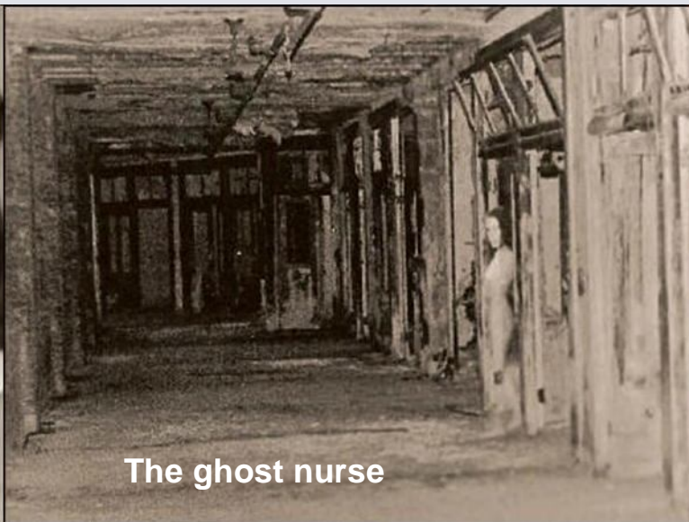
The ghost nurse