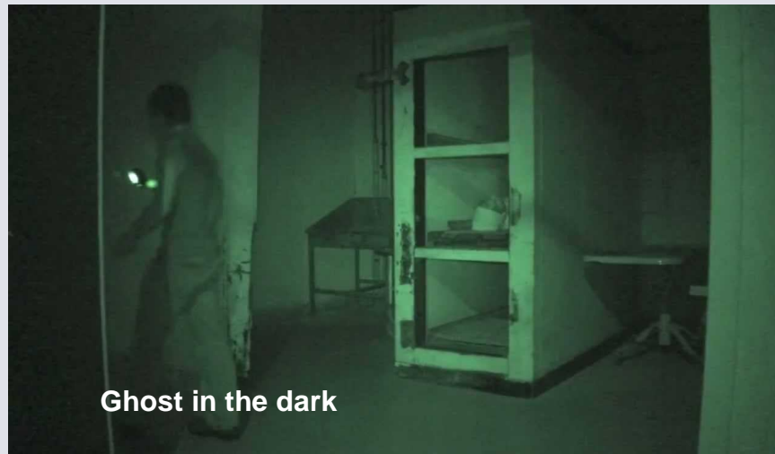
Ghost in the dark